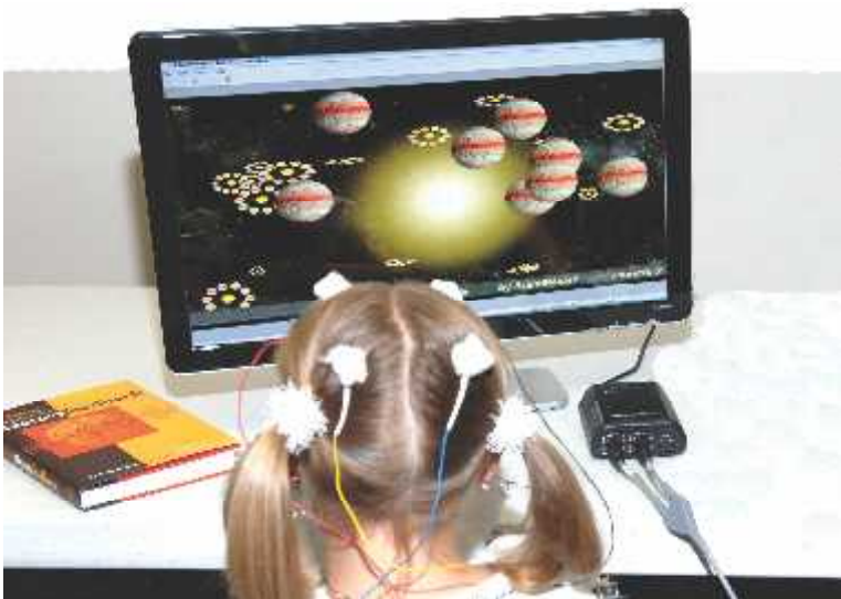
1, 2, or 4 channel remote training capability.